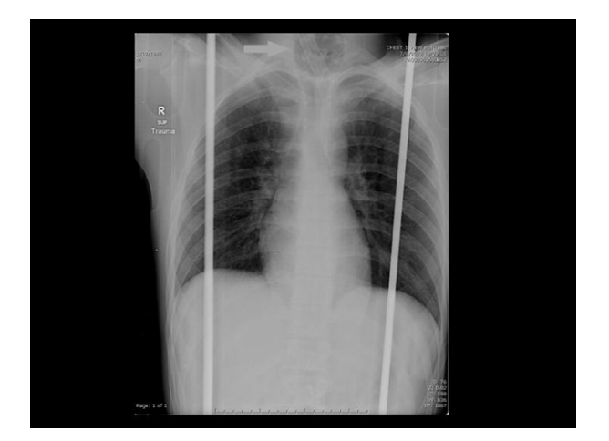
FIGURE 2. Chest radiograph showing the inflated Combitube balloon in the esophagus. Arrow indicates inflated proximal cuff of Combitube.

CT scan of his head revealed a unilateral basilar skull fracture involving the mastoid air cells of the temporal bone. Significant intraparenchymal hemorrhage was also evident. Air was visualized intracranially in the temporal