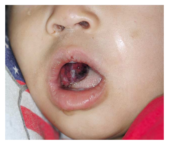
FIGURE 2. Appearance of the lesion the following morning reflecting the changes associated with thrombosis and focal necrosis.

Traumatic herniation of the buccal fat pad into the oral cavity was first reported in the English literature by Clawson et al<sup>1</sup> in 1968. Shortly thereafter, Brooke et al reported another case of intraoral prolapse of the buccal fat pad and coined the term traumatic pseudo-lipoma .<sup>2</sup> A review of the English literature indicates this is an extremely rare injury, with this case being one of only 19 ever reported (Table 1).<sup>1-15</sup> Analysis of