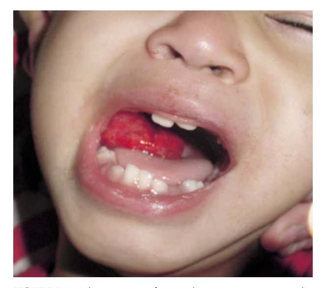
FIGURE 1. Initial appearance of intraoral mass on presentation to the emergency department.

Carter and Egbert. Traumatic Prolapse of the Buccal Fat Pad. J Oral Maxillofac Surg 2005.