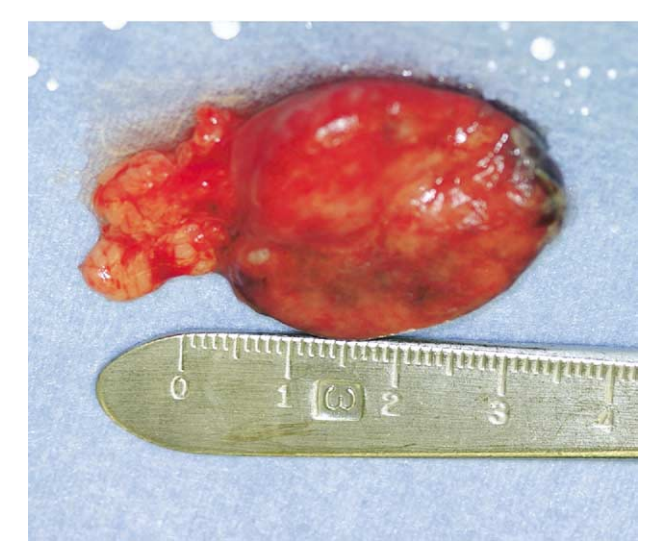
FIGURE 4. Excised specimen.